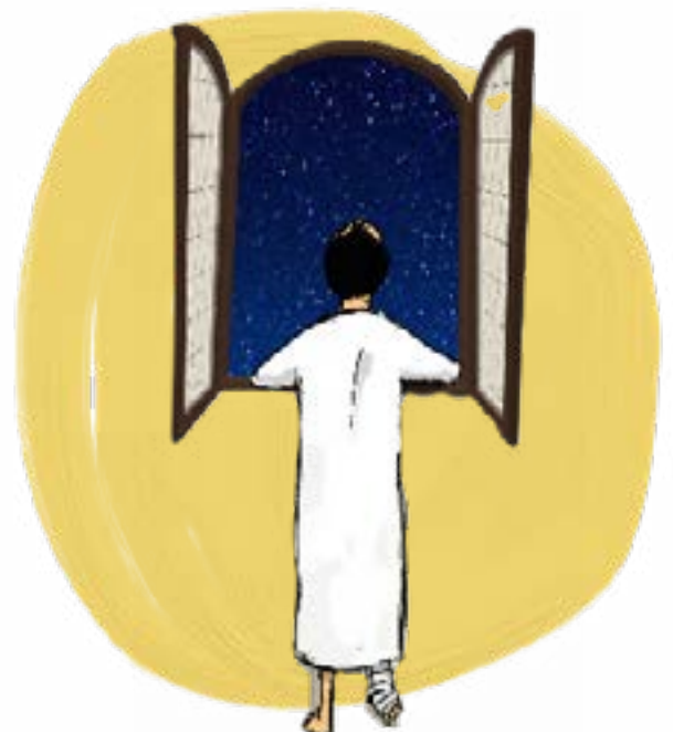
Artwork by Ignasi Flores